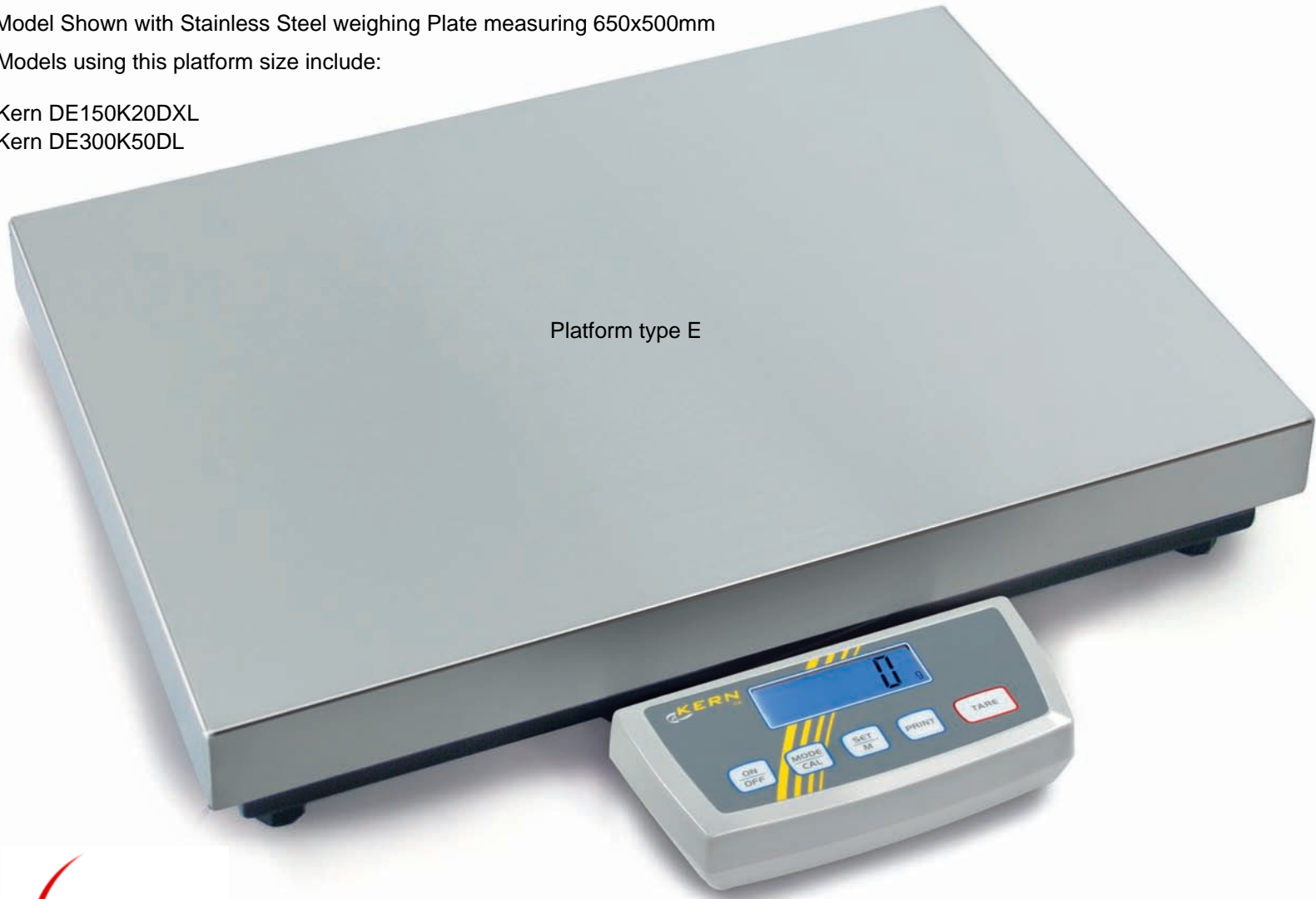
Platform type E