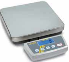
Weighing plate A 315 x 305 mm

With the recipe function you can weigh the different ingredients of a mixture. As a check, you can also recall the total weight of all the ingredients