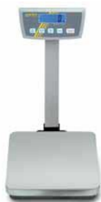
Column to elevate the display device, column height approx. 450 mm, similar image, KERN DE-A10