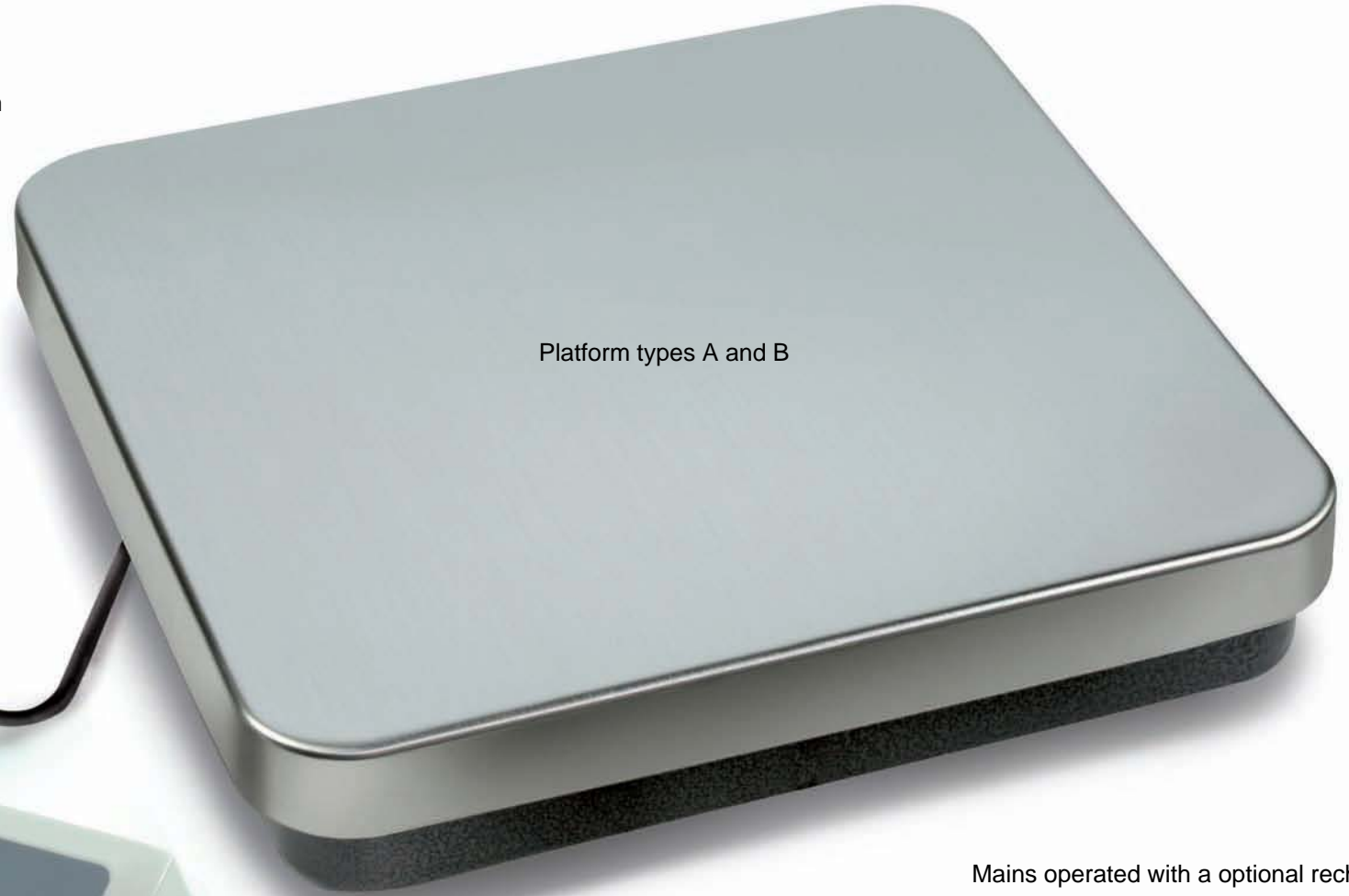
Platform types A and B

KERN DE15K0.2D KERN DE35K0.5D KERN DE60K1D KERN DE150K2D