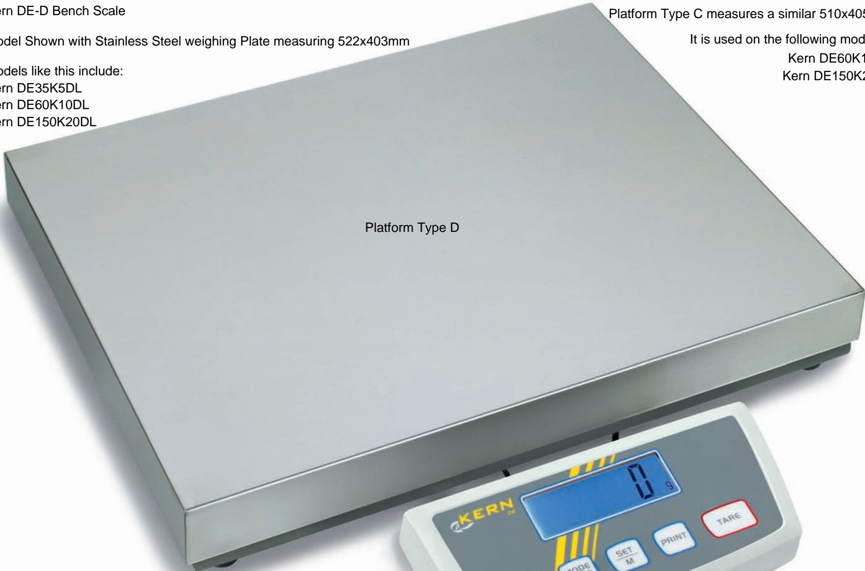
Platform Type D

It is used on the following models: Kern DE60K1DL Kern DE150K2DL