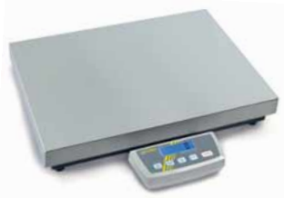
Weighing plate E 650 x 500 mm